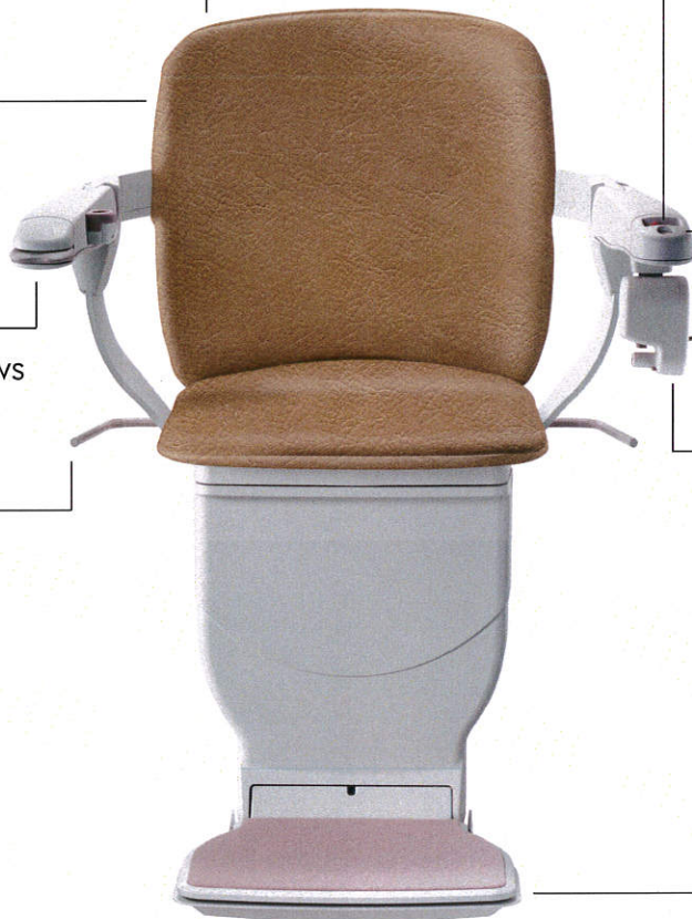
Siena chair with Tan upholstery